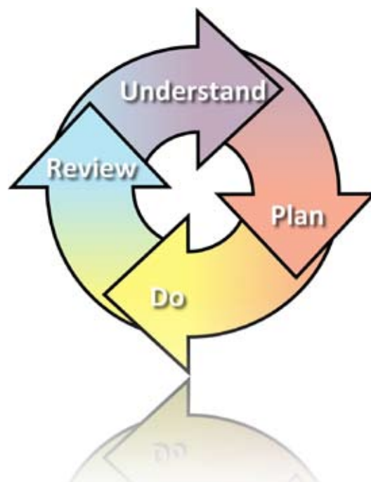
Figure 2. the Commissioning Support Programme's approach to commissioning

Below we set out the Commissioning Support Programme's approach to commissioning. This is echoed in other pieces of government guidance, including the consultation draft of new statutory guidance on Children's Trusts, and is consistent with other processes such as the DH/DCSF joint commissioning process for children's health outcomes (see below for how these work together).