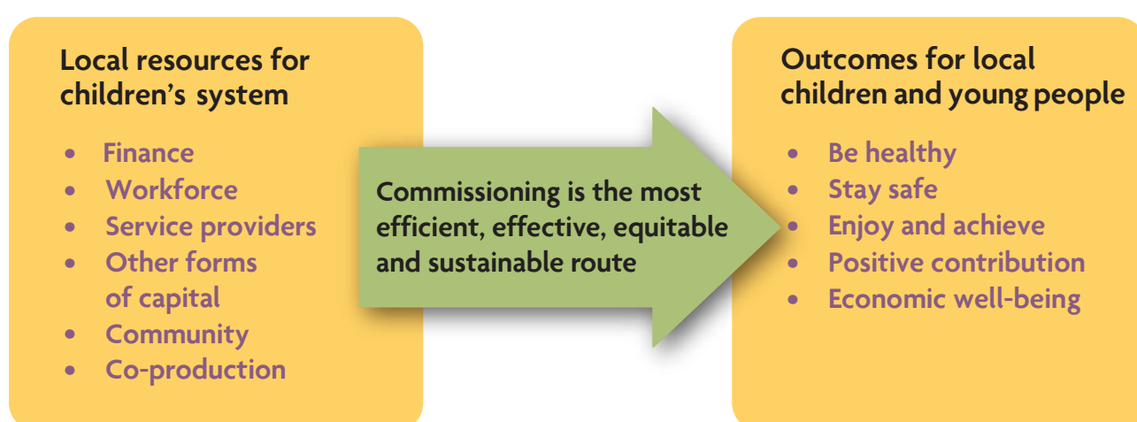
Figure 1. a graphical definition of strategic commissioning